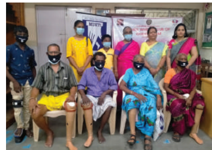
ARTIFICIAL LIMB & CALIPER