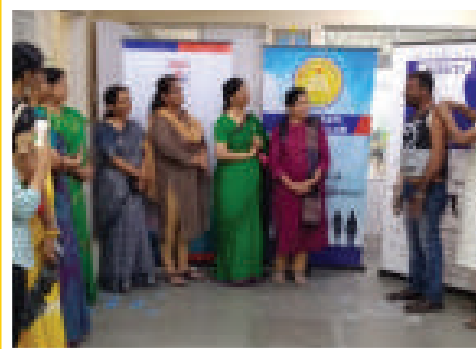
(SHAKTI LADIES CLUB TEAM VISIT)