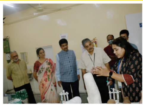
(FORD TEAM VISIT)